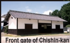
Front gate of Chishin-kan

The entrance area of the ruins of Iwamura castle is called "Joshi Park". The ruins of Iwamura Feudal Lord House, History Museum and Taiko-Yagura tell a lot about the history of the area. Every August, a torchlight performance of Noh is played at the ruins of Iwamura Feudal Lord House.